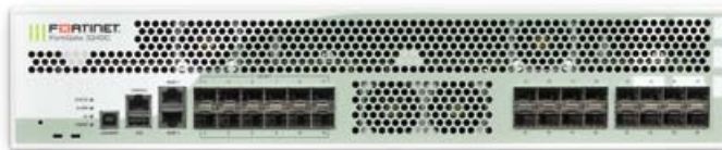
FortiGate 3240C Appliance (Front)